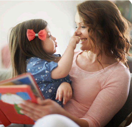
Family Homes for single mothers