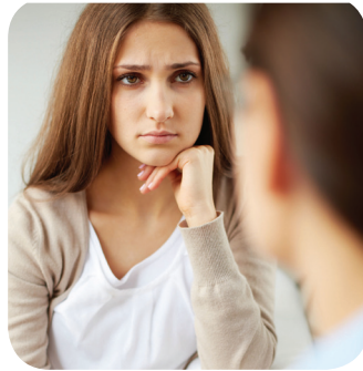
Foster care, counseling, and residential care for children and families in crisis.